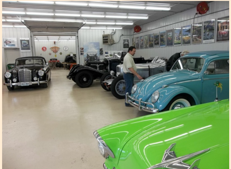
Main display room at Manns'