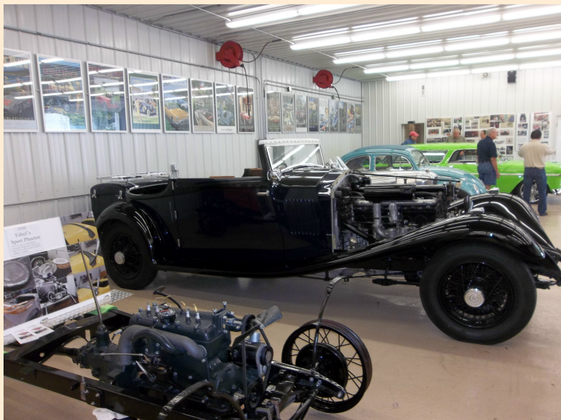
Rockefeller Family 1934 Rolls Silver Ghost being finished; Value $1 million or more & 1930 Edsel Ford Model A custom bodied 1 of kind