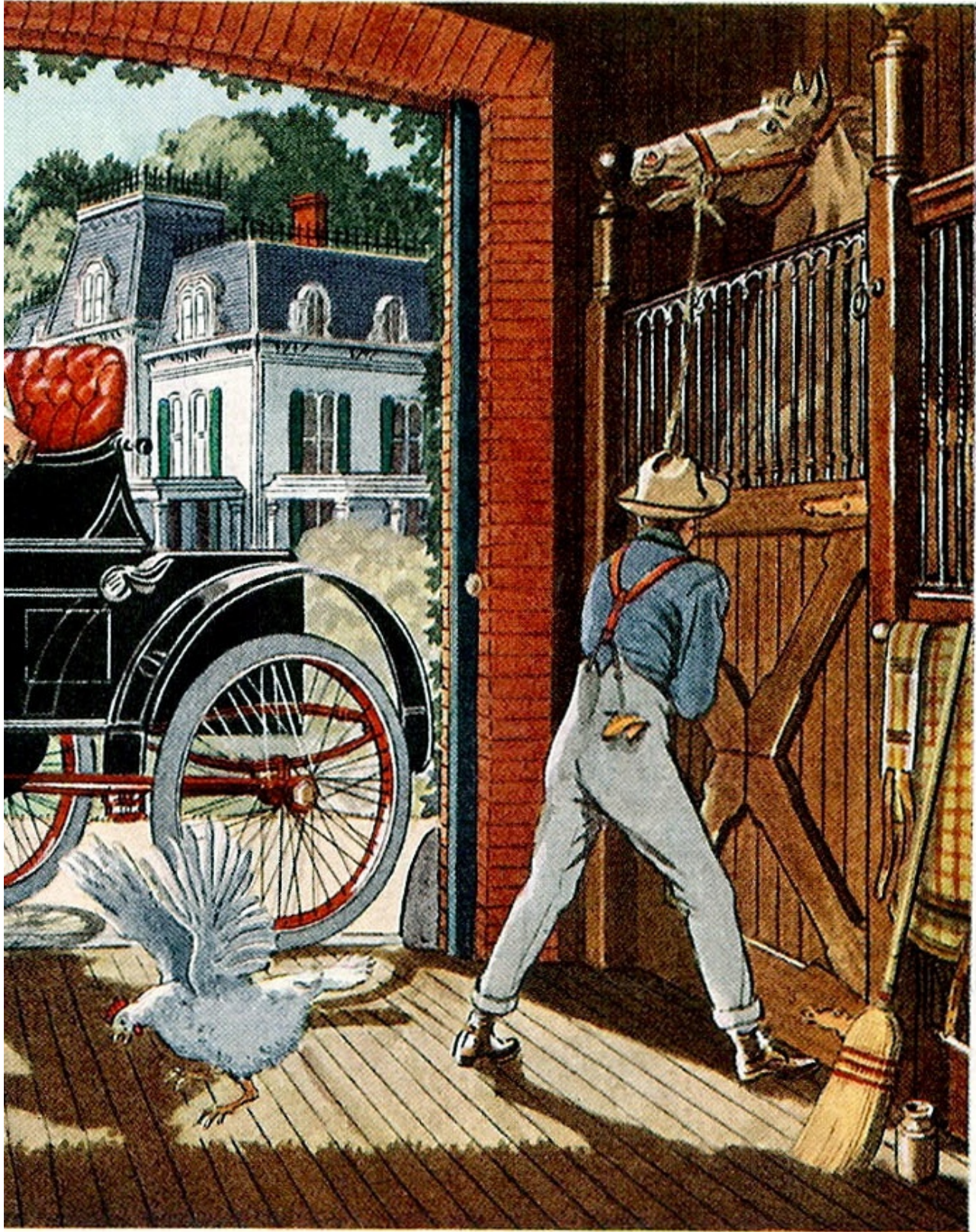
1899 PACKARD was the first Packard car. Its single-cylinder engine was mounted under the seat—making it easy to tell when it was overheating. Selling price was $1,250.