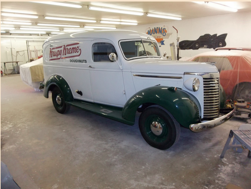
1940 Chevy Krispy Kreme delivery truck